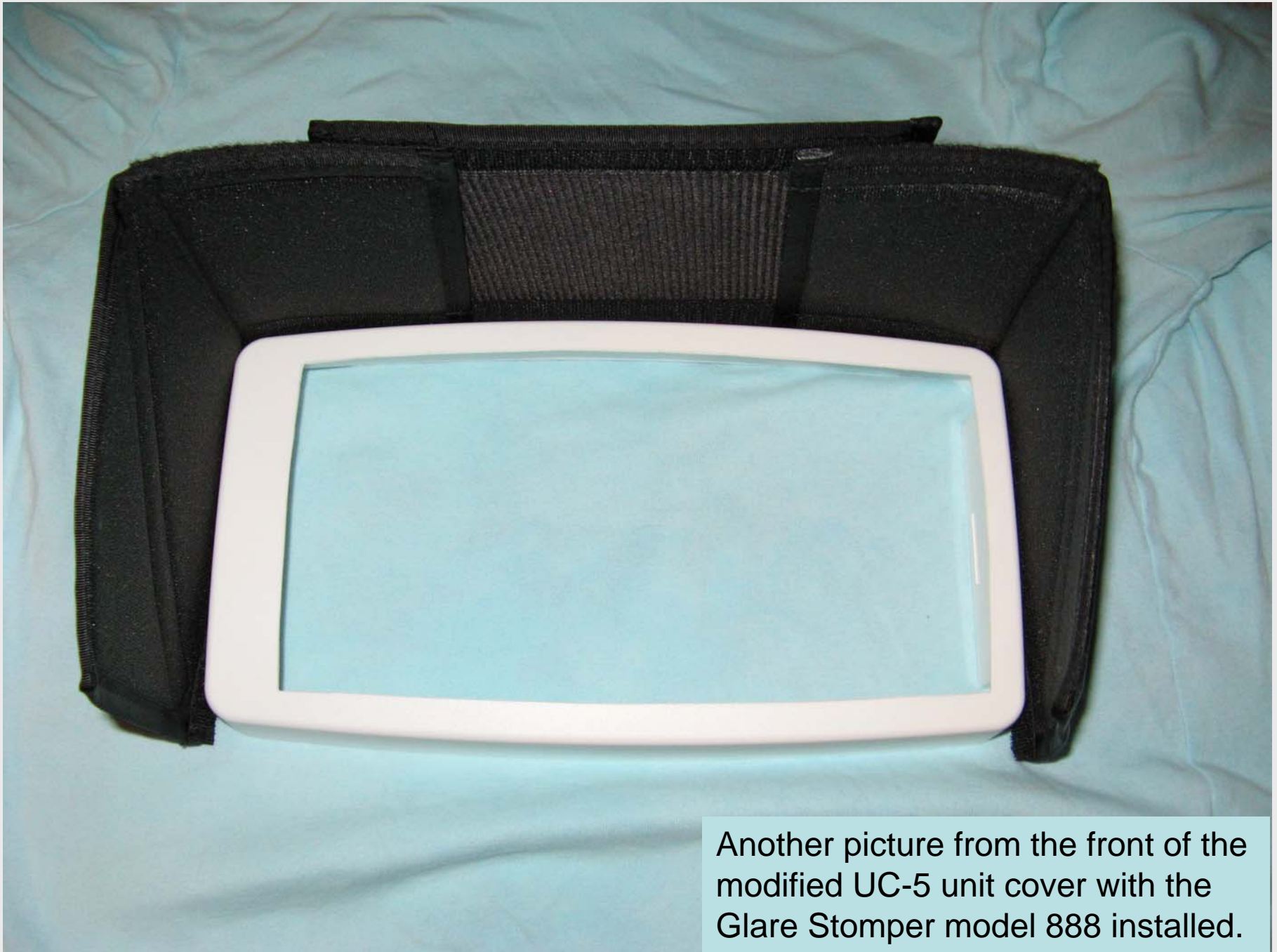
Another picture from the front of the modified UC-5 unit cover with the Glare Stomper model 888 installed.