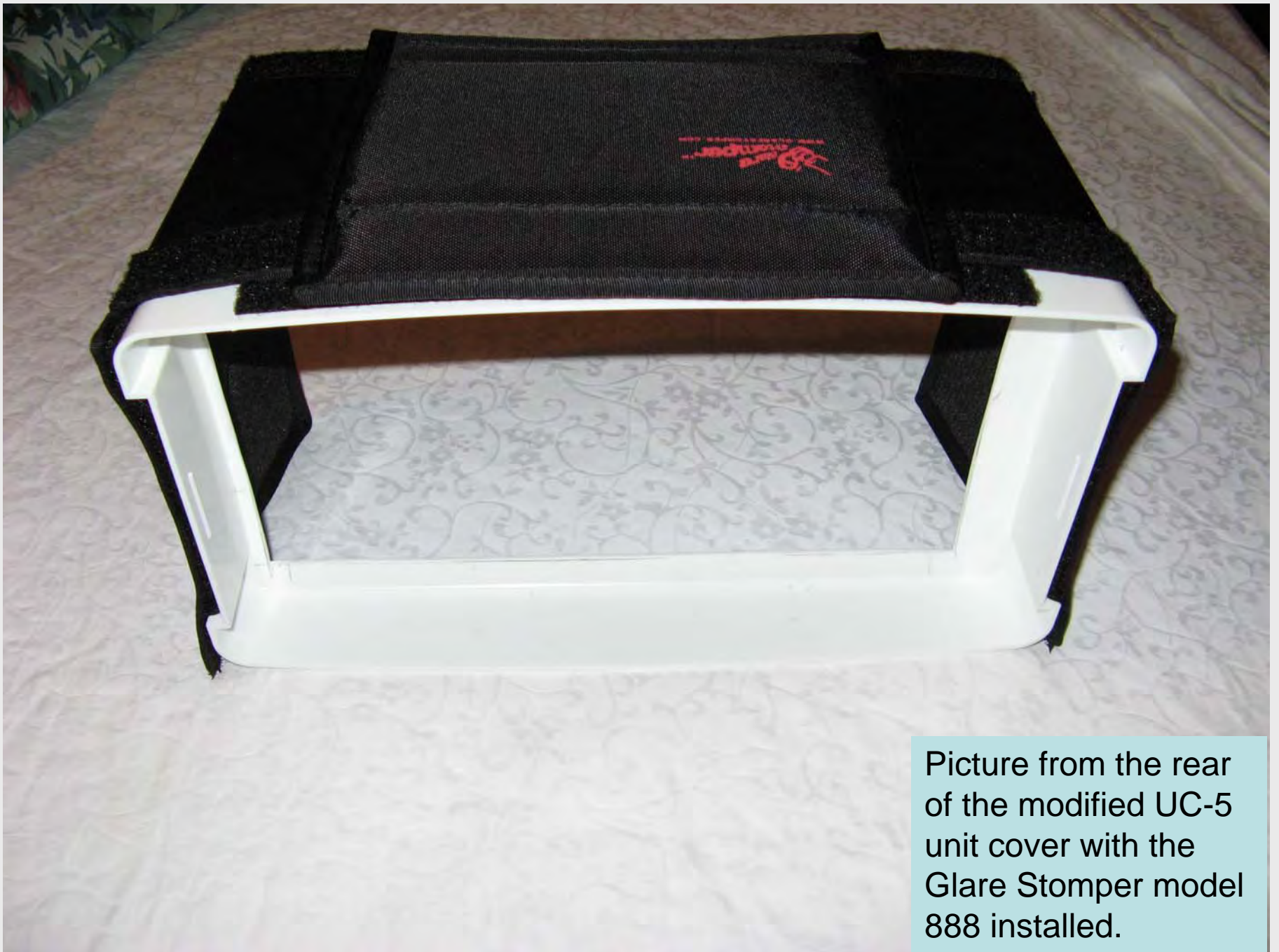
Picture from the rear of the modified UC-5 unit cover with the Glare Stomper model 888 installed.