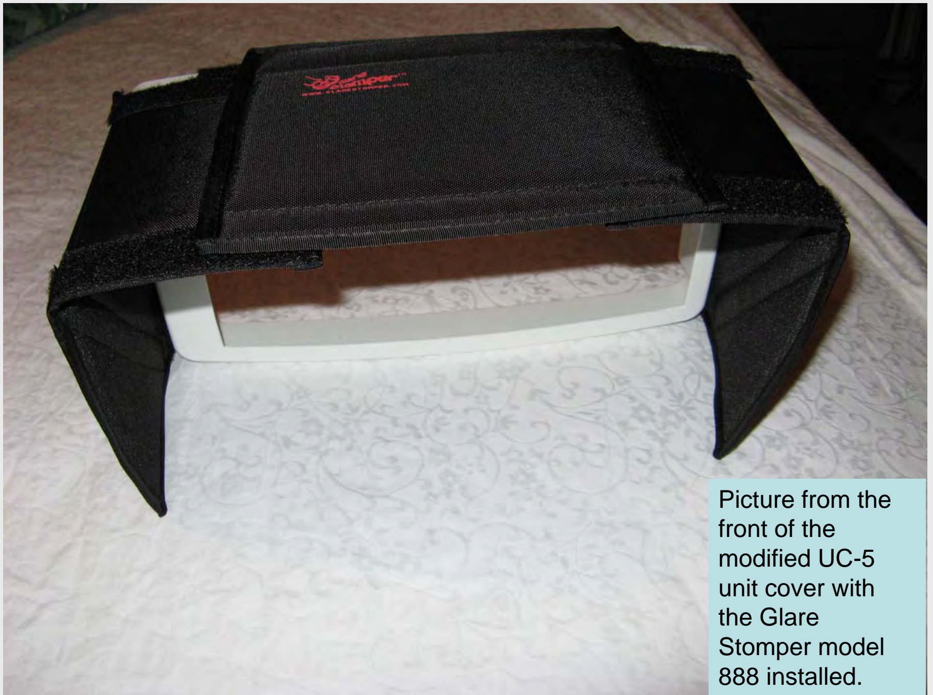
Picture from the front of the modified UC-5 unit cover with the Glare Stomper model 888 installed.