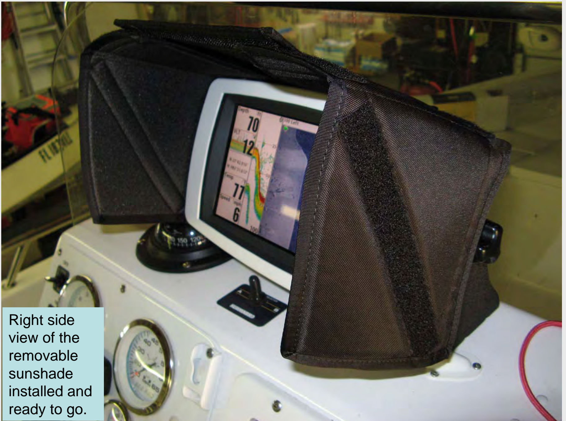
Right side view of the removable sunshade installed and ready to go.