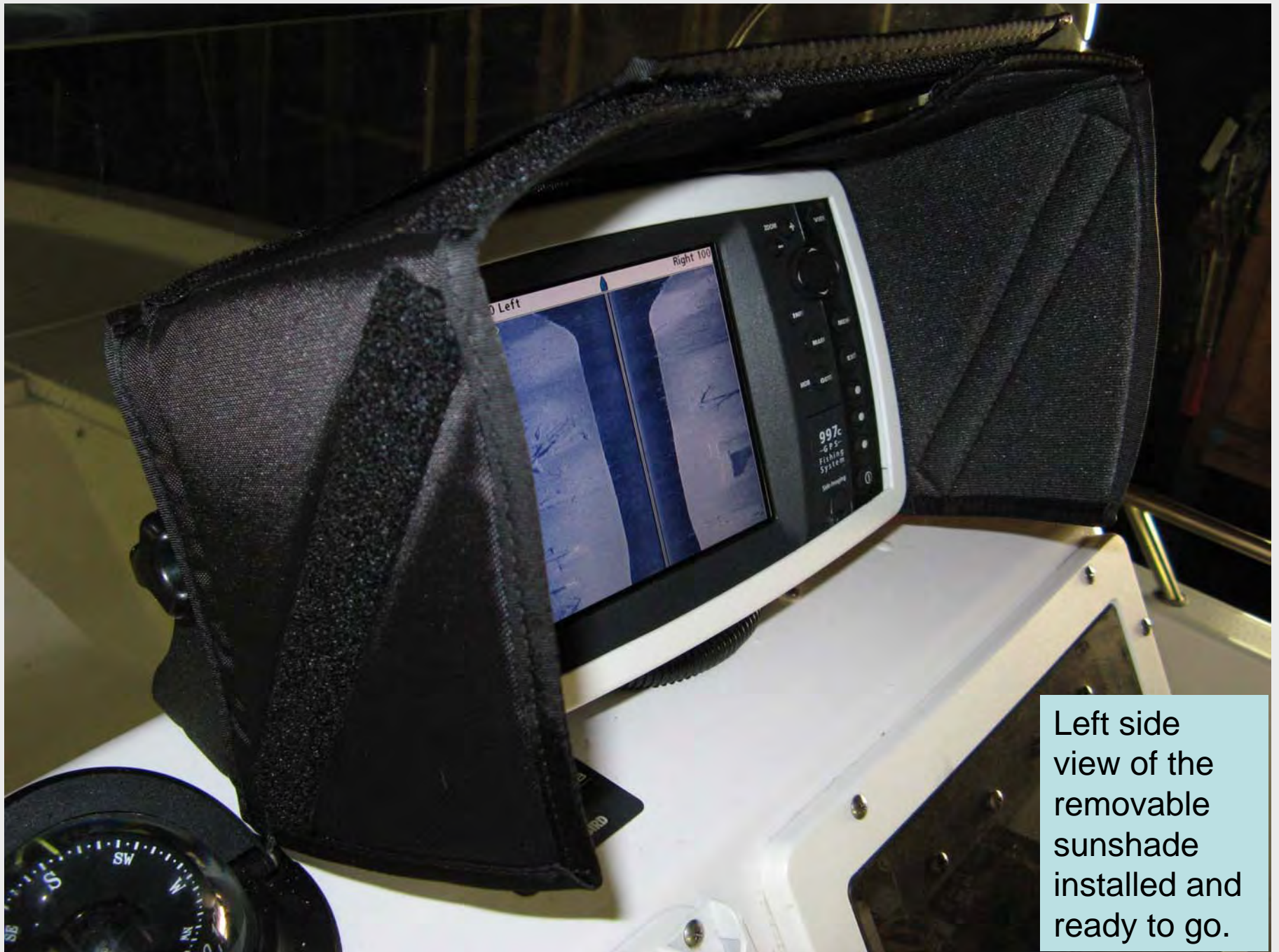
Left side view of the removable sunshade installed and ready to go.