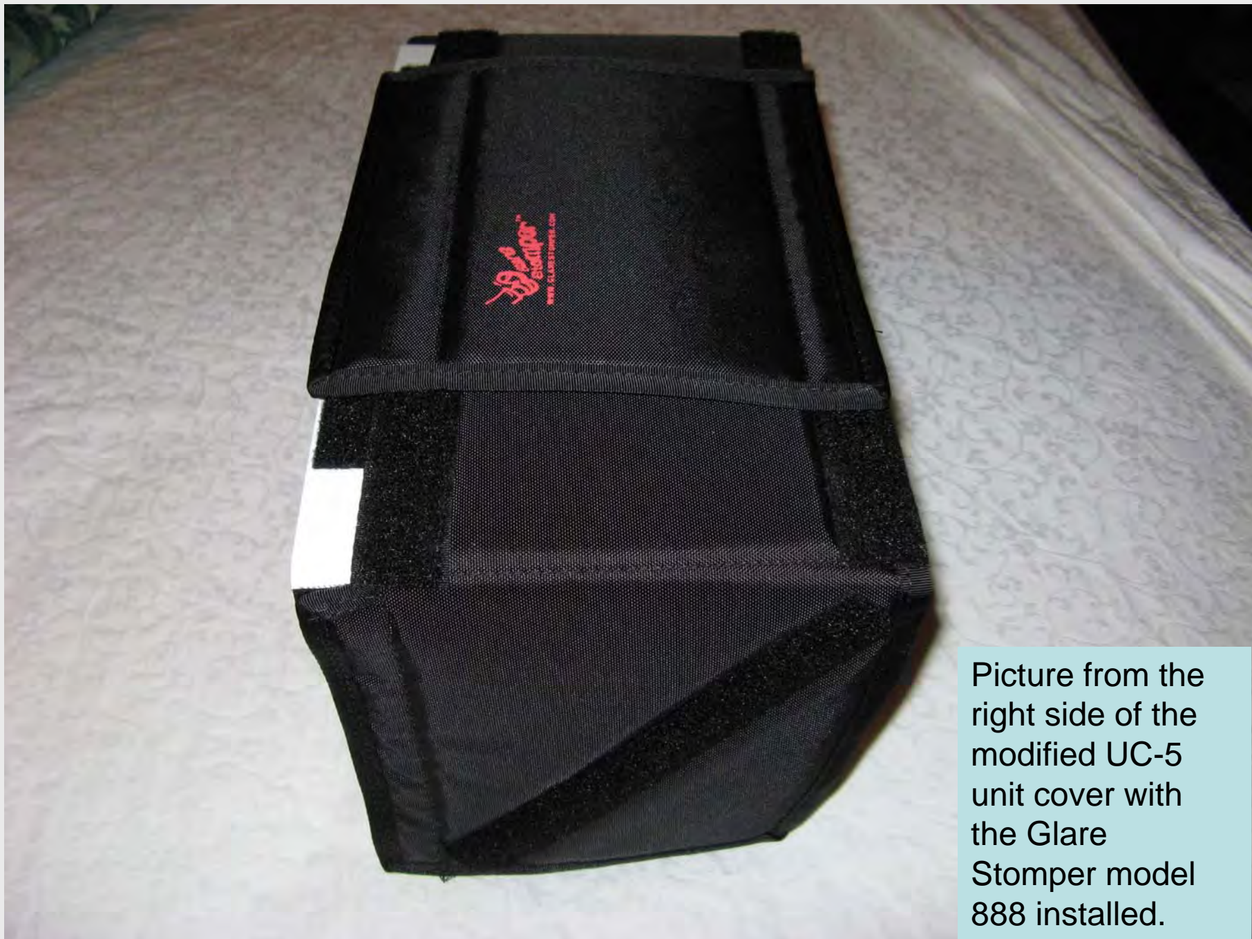
Picture from the right side of the modified UC-5 unit cover with the Glare Stomper model 888 installed.